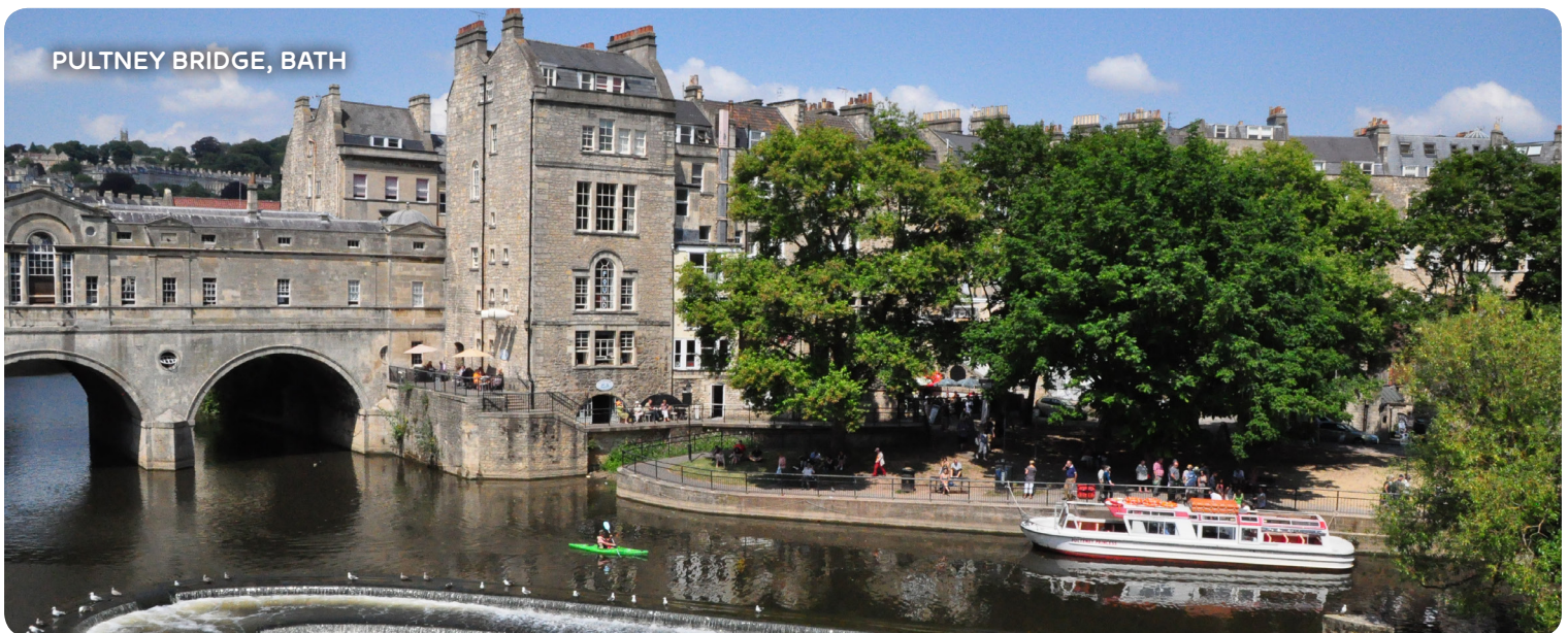
PULTNEY BRIDGE, BATH

Contact BANES Virgin Care ASIST team to find out more information Call 01225 396000 (Please select option 2 for enquiries)